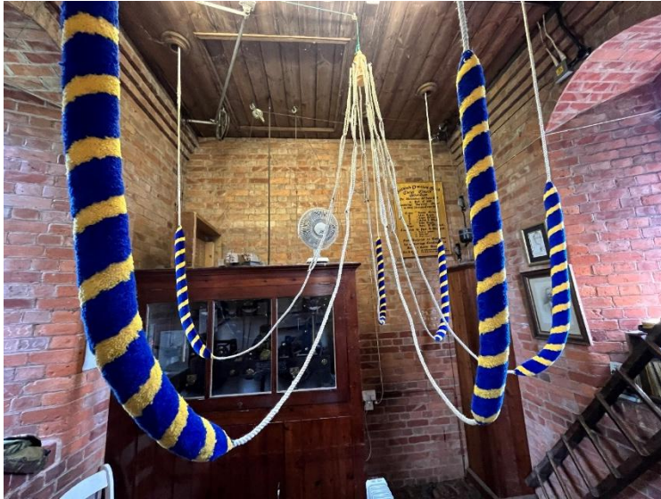
Our new ropes