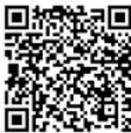
Re-Form Heritage and Factum Foundation proposal